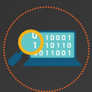
Tax Reporting & Audits