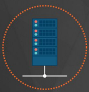
External Hard Drives