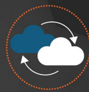
Cloud Based Storage